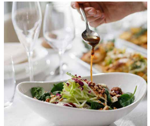
Sampling delicious food with fellow residents at a regular weekly dinner