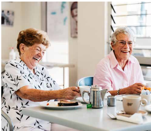
Grabbing a cappuccino and a slice of cake at the local coffee shop