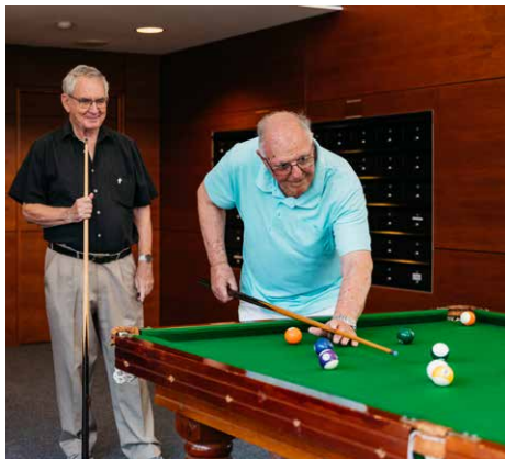
Gathering around the billiards table for a drink any afternoon of the week